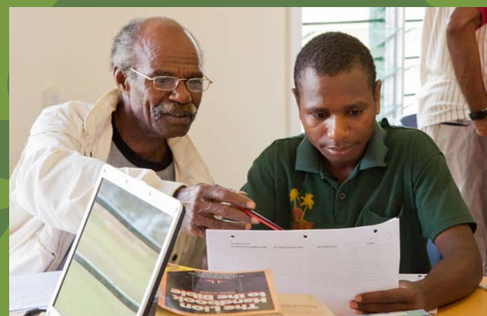
Two translation students working in a class at Ukarumpa, PNG