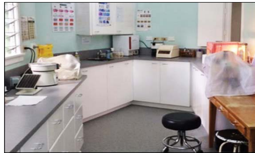
The finished lab in full use

A team of six stripped out the old lab which included identifying 240 and 110 volt power and lighting circuits- quite a task! A doorway was closed up, a new window cut into a wall and new Masonite wall and ceiling sheeting installed. Some of the team worked in the joinery to construct new cabinetry and benchtops to fit into the odd-shaped room.