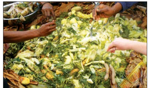
Mumu-wrapped in banana leaves and cooked in a pit

God with these people. After church we visited a village where they prepared a mumu (traditional meal) for us. It was a half hour walk to the village, walking along a dirt trail through bush. It is humbling to see how these people live and how happy they are to share with the 'white skins'.