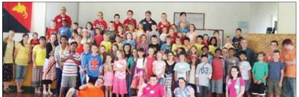
Vacation Bible School children and leaders

On the Sunday the team went to church in Aiyura. It was a wonderful experience to worship